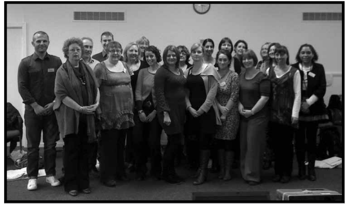
Delegates of the 2011 Training Trainers course

Feedback received from the delegates on the course was extremely positive and we hope that the enthusiasm for implementing family work which is always apparent from the delegates towards the end of the course will continue to thrive!