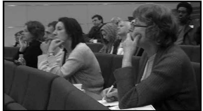
Delegates at the event