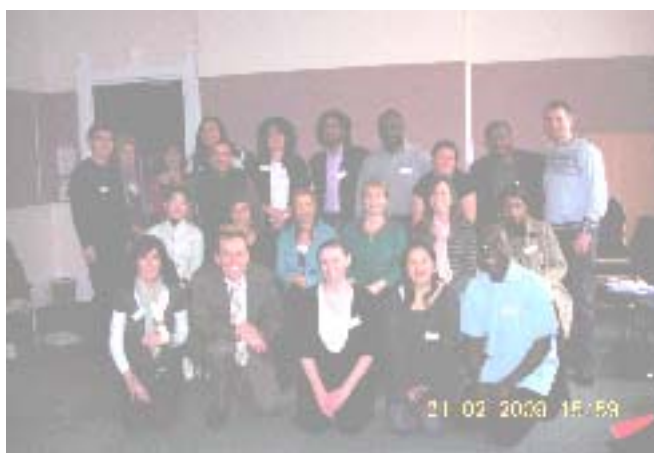
Delegates at the Early Intervention BFT course in Birmingham (February 2008)

On our Training Trainers course this year, a number of those trained as trainers work on Early Intervention teams and plan to roll-out courses locally over the coming year. The cascade model continues to be very successful in helping large numbers of staff to develop skills.